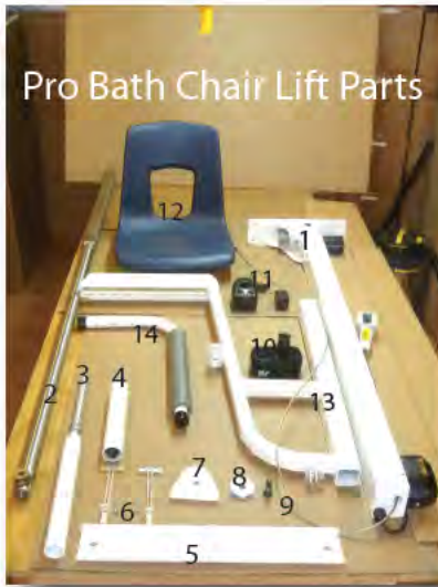
Pro Bath Chair Lift Parts